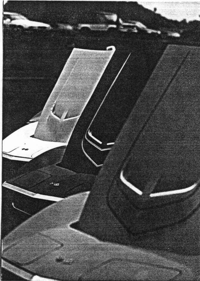
GALENA - 1989